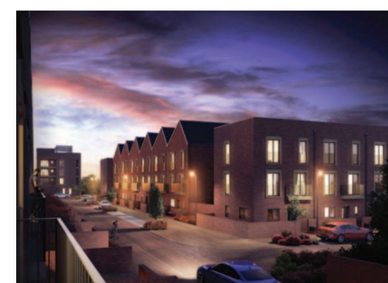
The Electric Quarter, Ponders End